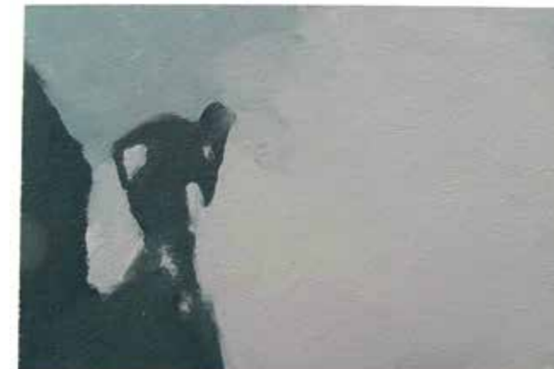
»Die weiße Hölle vom Piz Palù« 6 of 37 paintings, oil on chipboard, 10 x 15 cm, 2000