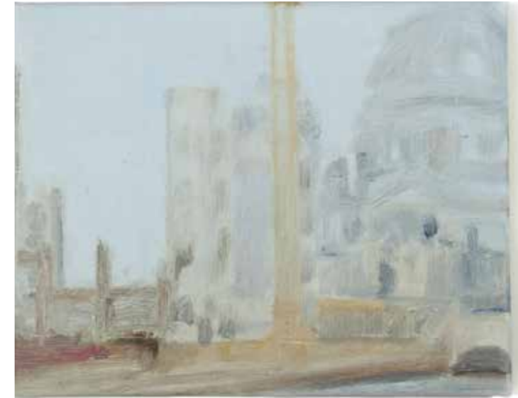
»Latitude 52.5175 / Longitude 013.4028» 7th of September 2008, 1 / 120 paintings Oil on canvas, 24 x 30 cm