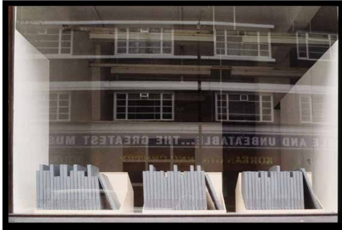
»Ratcliff Cross Stairs«

64 cardboard boxes including 64 paintings, 3 files made of wood, sizes of paintings: 34 x 38 cm, 40 x 38 cm, 46 x 44 cm 1994/1995