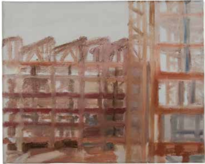
»Latitude 52.5175 / Longitude 013.4028» 10th of November 2007, 1 / 120 paintings Oil on canvas, 24 x 30 cm