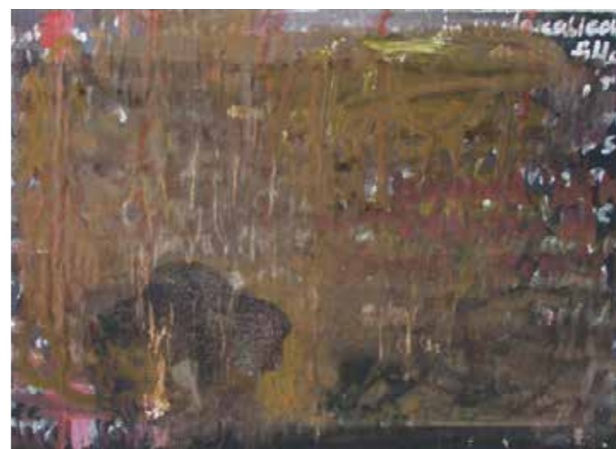
»Hopeless« 07/03 1996, 1 of 40 Photocopies on chipboard Tempera, 35,5 x 25,5 cm, London