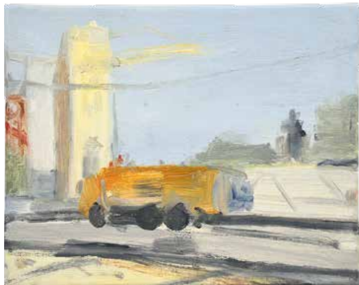
»Latitude 52.5175 / Longitude 013.4028» 3rd of May 2013, 1 / 60 paintings Oil on canvas, 24 x 30 cm