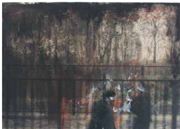
«Hopeless» 02/15 1996, 1 of 40 Photocopies on chipboard Tempera, 35,4 x 25,5 cm, London, privat collection