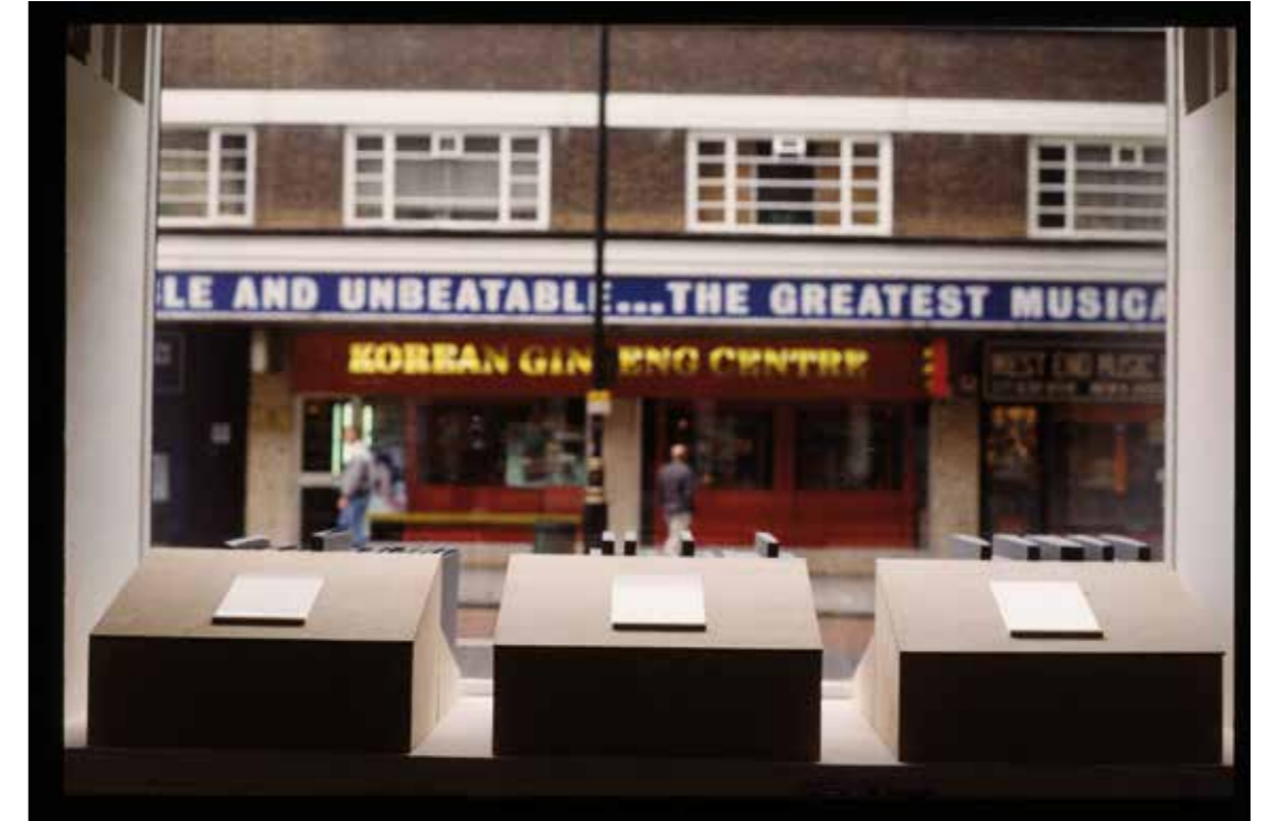
»Ratcliff Cross Stairs«

Outside view Central St. Martins College, Charing Cross Road, London 1995