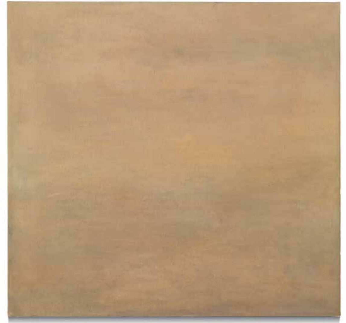
«Ratcliff Cross Stairs» 27th of January 1995

At one spot you can go down via staircases directly to the river in Cable Street, East London. The place is called Ratcliff Cross Stairs. There, directly at the waterfront, I painted the pictures which reflect the influence of the tides. All this was transferred into three different sizes, which correspond to three different stages: high, low and in between.