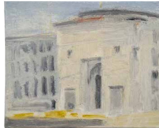
»Latitude 52.5175 / Longitude 013.4028» 5th of March 2015, 1 / 60 paintings Oil on canvas, 24 x 30 cm