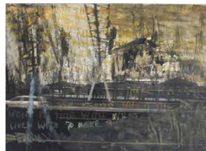
»Hopeless« 03/10 1996, 1 of 40 Photocopies on chipboard Tempera, 35,5 x 25,5 cm, London, privat collection