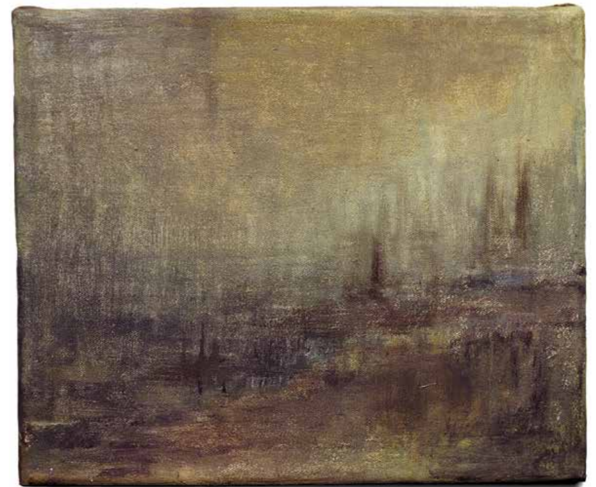
«Pegel 103 m ü. NN» 1 of 183 paintings, oil on canvas, 20 x 24 cm, Dresden 1993/94

From October 1993 to July 1994 I made 183 pictures, a picture a day. Every picture was painted on the the riverbank of Dresden, at the same spot. The size of the 183 pictures is 20 x 24 cm. Some of the pictures were placed in archives. The works titel »Waterlevel 108 m ü. NN« refers to the heights of the river Elbe at Augustusbrücke.